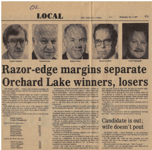
1977 Orchard Lake City Council election article