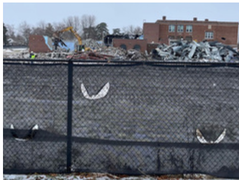
Demolition begins, December 2025