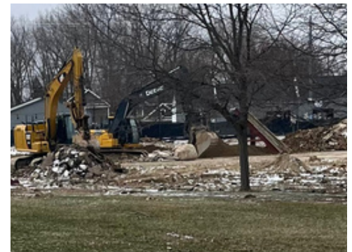
Remainder of the school after demolition, 2026