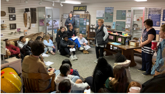
Five GWBHS volunteers helped with collection research efforts by West Bloomfield High School students in a March Museum visit

We've seen so much this year. March 12 was a horrific day for the Greater West Bloomfield community with the attack on Temple Israel. Our support is with the Jewish community.