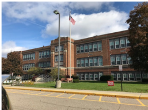
Last days of Roosevelt School