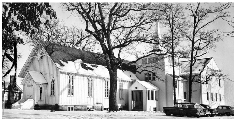
The church with educational addition, c. 1959