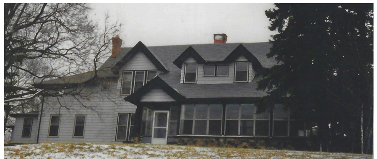
The former Sunset Inn (facing Orchard Lake) prior to demolition, 1997