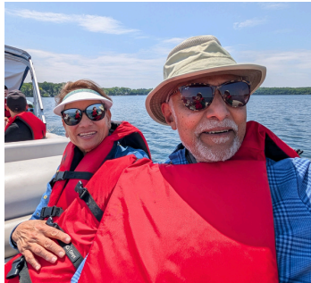
Apple Island Tours are planned for Sunday, September 14, 10-3:40 pm. Make your reservation!