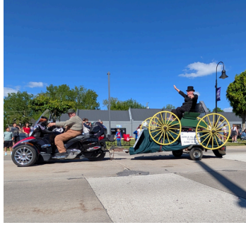
Our Keego Harbor Memorial Day parade GWBHS historic float was a hit!