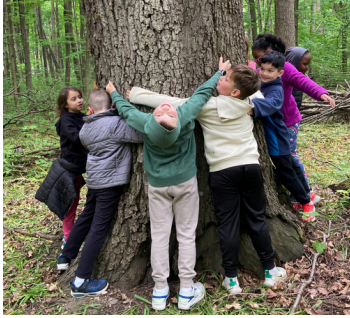
Second-grade WB School students enjoyed visits to the Museum and Apple Island.

We enjoy connecting people to local history in person!