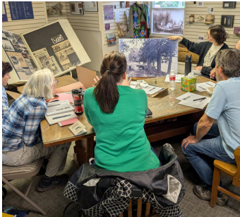
Apple Island docents review their new donated historic high-definition photos of Apple Island!