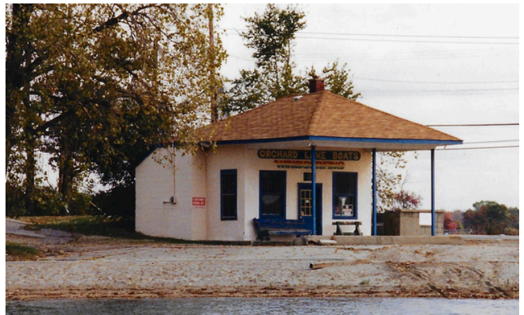
Orchard Lake Boat Livery on the corner of Orchard Lake Road and Indian Trail, 1997