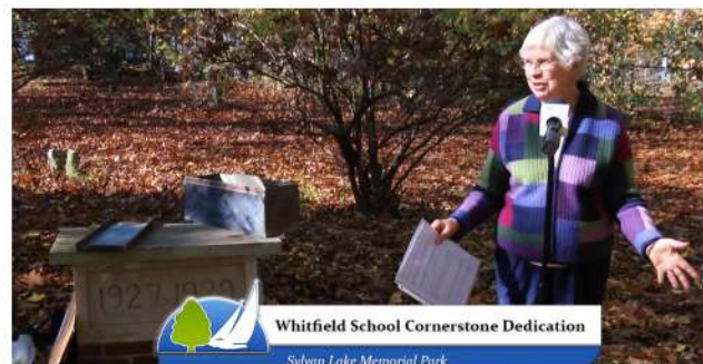
Whitfield cornerstone bench closing ceremony, November 3, 2022