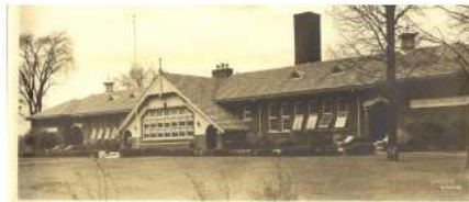
Daniel Whitfield School, 1930s