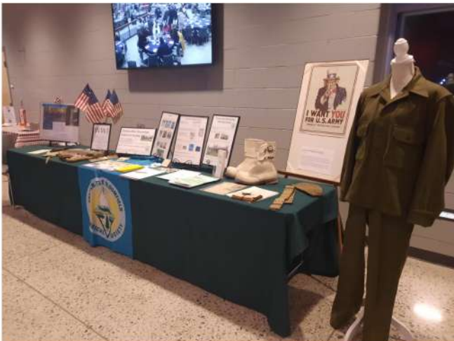
Veterans Heroes Appreciation Breakfast 2022

New volunteers are needed at every level to keep this volunteer Society moving forward and help work on 2022-2027 strategic priorities!