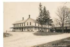
Postcard of the Orchard Lake Hotel

This Hotel photo with building to the right of the hotel is not identified, but based on the age of the picture it is not the current DPW building. The owner, Mrs. Woodward, was running an amusement park and this may have been a skating rink. The village wanted to buy the old hotel but Mrs. Woodward wanted too much money.