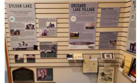
New Sylvan Lake & Orchard Lake Exhibit Panels

New permanent exhibits debuted April 23 at the Orchard Lake Museum Grand Open House. GWBHS members and community leaders were invited to see permanent exhibits highlighting the history of each municipality, Albert Kahn, schools, and first responders!