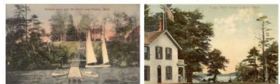
Lake View and Street View Postcards of the Orchard Lake Hotel