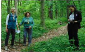
Volunteer Docents on Apple Island in 2021

history with a presentation at 2 pm and 3 pm. Newly loaned Cranbrook Institute of Science 2002 Island artifacts will be exhibited.