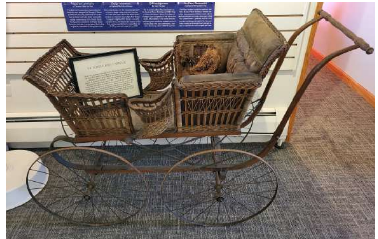
DeConick Victorian Baby Carriage