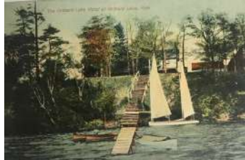
Orchard Lake Hotel postcard

GWBHS welcomes donations of local historical artifacts, which can provide needed provenance (place of origin or early history of something) to be included in exhibits. Recent donations include: