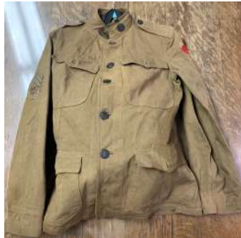
WWII U.S. Army uniform