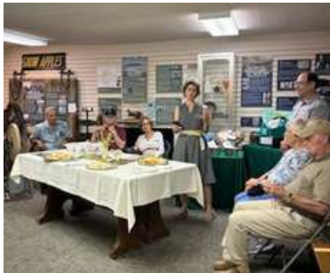
Annual Appreciation Reception

This fall we are excited to share history highlights featured elsewhere!