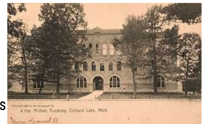
1905 MMA Postcard