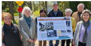
Holiday House Marker Dedication