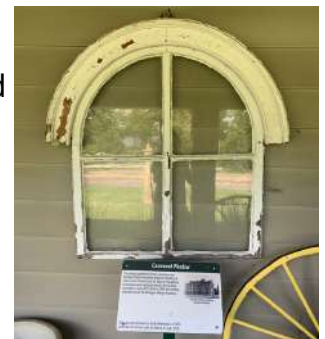
Window from the original building on display at Orchard Lake Museum

during construction. An upper section with the top arch is now on display on the porch of the Orchard Lake Museum. According to Mellerowicz, the new windows were made by a company in Poland for an exact fit in the opening, requiring no filler. Mellerowicz has an extensive collection of photos of the entire Orchard Lake campus buildings, from its day of the military academy to today.