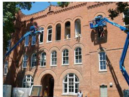
2018 renovation with new windows