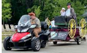
Doctor's Carriage float