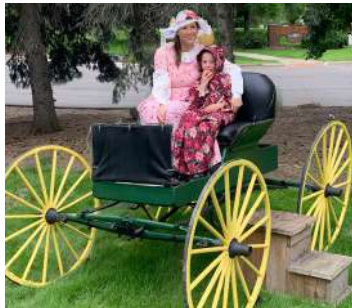
Apple Island Tours