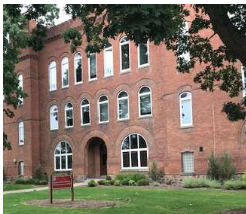
The newly renovated Academic Building, with the Constantakis namesake