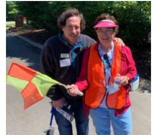
Volunteers enjoy helping at GWBHS programs!

GWBHS is always looking for new volunteers. If you are 18+ and interested in sharing local history with the community, consider becoming an Open House Host. Training is provided! View more volunteer opportunities at GWBHS.org/Support/Volunteer/ or contact me at anna@gwbhs.org for details.