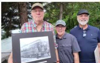
Presenters at Pine Lake Marina Tour!