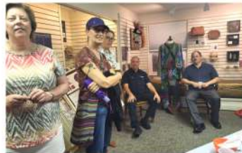
Waiting for Appreciation Reception raffle prizes!