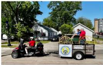
Memorial Day Parade carriage debut!

Many collection donations were received and the Research Committee answered nine information requests!