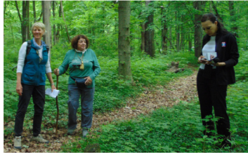
Volunteer Docents on Apple Island in 2021

history with a presentation at 2 pm and 3 pm. Newly loaned Cranbrook Institute of Science 2002 Island artifacts will be exhibited.