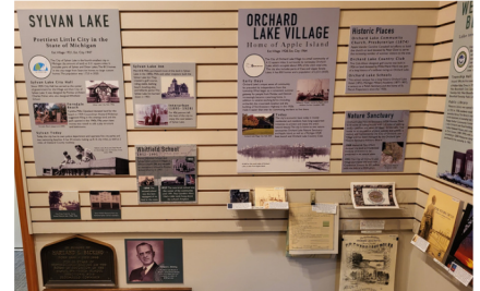
New Sylvan Lake & Orchard Lake Exhibit Panels

New permanent exhibits debuted April 23 at the Orchard Lake Museum Grand Open House. GWBHS members and community leaders were invited to see permanent exhibits highlighting the history of each municipality, Albert Kahn, schools, and first responders!