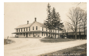
Postcard of the Orchard Lake Hotel

This Hotel photo with building to the right of the hotel is not identified, but based on the age of the picture it is not the current DPW building. The owner, Mrs. Woodward, was running an amusement park and this may have been a skating rink. The village wanted to buy the old hotel but Mrs. Woodward wanted too much money.