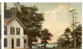
Lake View and Street View Postcards of the Orchard Lake Hotel