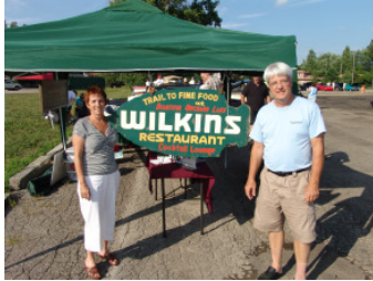
Greater West Bloomfield Historical Society