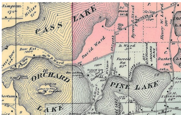
1872 West Bloomfield Township Map