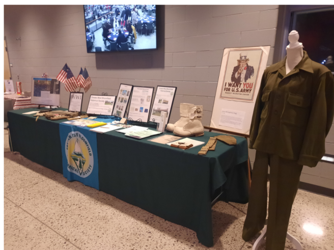
Veterans Heroes Appreciation Breakfast 2022

New volunteers are needed at every level to keep this volunteer Society moving forward and help work on 2022-2027 strategic priorities!