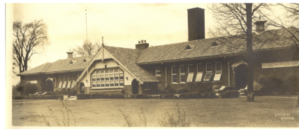
Daniel Whitfield School, 1930s