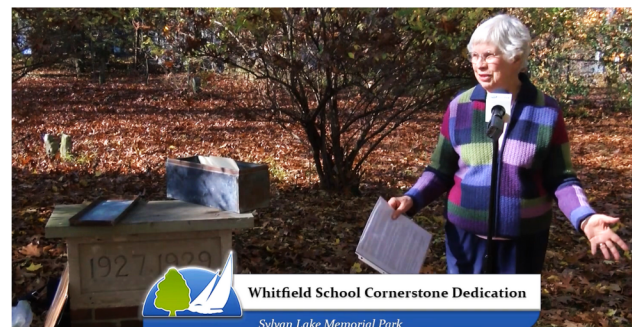
Whitfield cornerstone bench closing ceremony, November 3, 2022