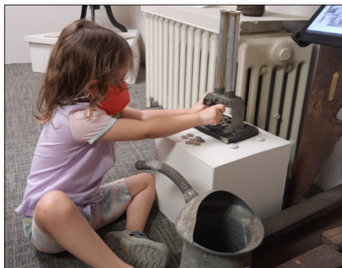
Stop by the Museum during an open house and interact with the exhibits: deposit and "make change" for a trolley rider; view transportation tablet slides; and check out the 1895 and 1899 Michigan Military Academy publications.