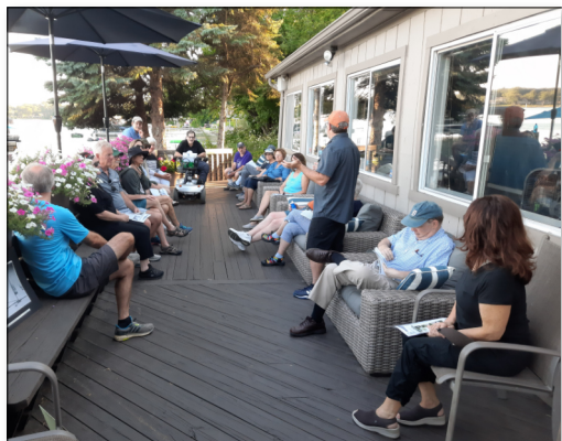
The Pine Lake Marina Tour was successful, with opportunities to meet new people and learn about the Marina.

Personally, this summer I've enjoyed celebrating my subdivision's founding 100 years ago. What I've learned through GWBHS volunteerism is included in our book about the Pleasant Lake area. See articles elsewhere.