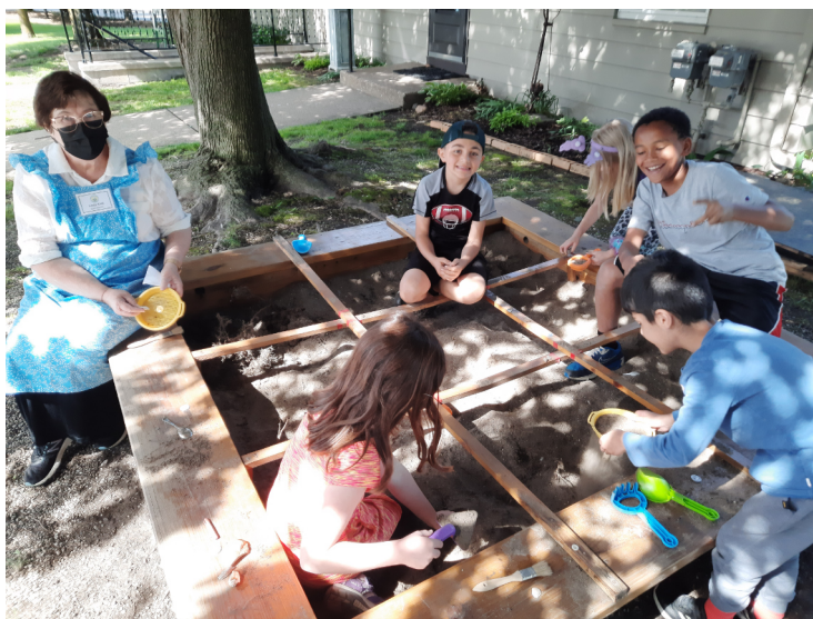
Experiencing Archaeology Activity