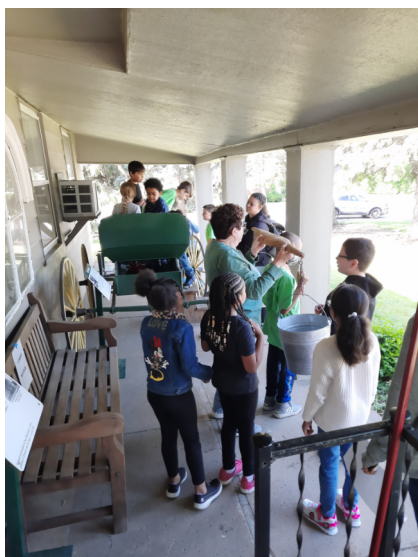
Carriage & Yoke

Students participated with parents at four stations outside the museum. They learned how early school sites were often donated by local farmers. They compared farming practices of Native Americans and early farmers. They tried children's farm chores. A visit to the oldest item on the museum grounds, a gift of the glaciers, was a big hit before they moved on to the archeological dig. Finding objects, natural and manmade, told the story of their past. The arrowheads, animal bones, seeds, stones, flatware, buttons, and other artifacts led to more inquiries. Inside the museum they discussed what they found, what it may have been used for, and how it ended up in the dig site. Questions expanded beyond the time limit. "We can't wait to do it again!" Carol Fink and Linda Kidd.