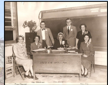
Scotch PTA officers, 1953