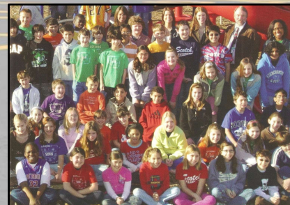
Scotch 5 th graders, 2007