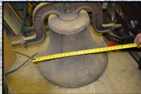
In 2013, the bell that presumably hung above the one-room school house was brought out of storage and installed on a tower outside the school.