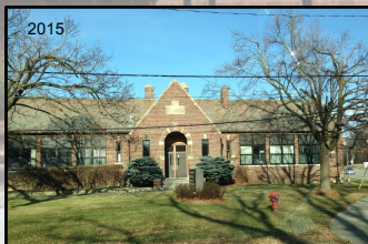
After elementary instruction moved to the new Scotch School in 1989, West Bloomfield School District Administration and Community Services relocated to the old brick building.