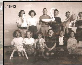
Parent involvement has been a strength of the Scotch community since the founding of the first school in the mid-1800s. Favorite PTA/PTO activities have included Hot Dog Day, Carnival, and Fund Run.