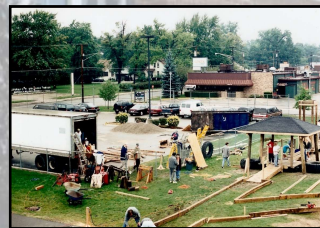
Community playground rebuilding project draws over 400 volunteers, 1996

During its years as a high school, Roosevelt's athletic field was located on Summers Street, about a mile from the school. Controversy erupted in 1972 when the land was sold by the School Board to a developer. Many in the Keego Harbor community thought the land should have been kept for community use.