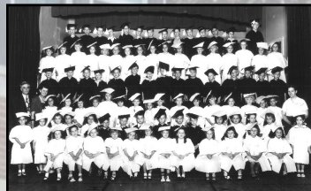
Kindergarten class, 1949