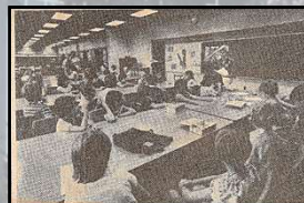
Magnet multi-age classroom, 1978

Roosevelt High School had a long-history of athletic success for both boys and girls. Teams competed as the Roosevelt Presidents but identified themselves as "Keego Harbor" on their letter sweaters and in yearbooks.