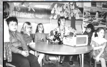
Learning by filmstrip and record-player, 1969