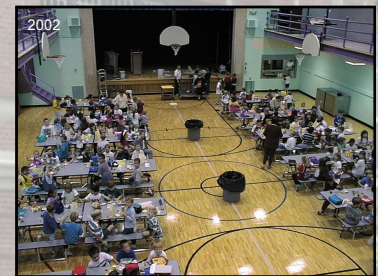
Major renovations move lunchtime from the gymnasium to new multi-purpose room, 2002

Roosevelt housed kindergarten through sixth grade after the new high school was built at the corner of Orchard Lake and Commerce Roads in 1955. With the move to a "6-8" middle school model in 1971, Roosevelt transitioned to preschool through fifth grade.