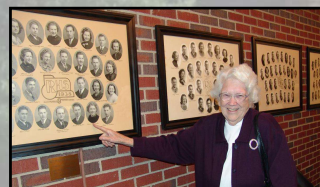
"Roosevelt Remembers" historic exhibit installed in celebration of school's 85th anniversary, 2005