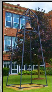
School bell, attributed to Keego Harbor School, restored and mounted outside Roosevelt, 2015

Roosevelt housed kindergarten through sixth grade after the new high school was built at the corner of Orchard Lake and Commerce Roads in 1955. With the move to a "6-8" middle school model in 1971, Roosevelt transitioned to preschool through fifth grade.