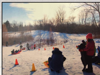
Preschool was added in the early 2000s and second grade moved from Scotch Elementary School to Gretchko in the fall of 2015.