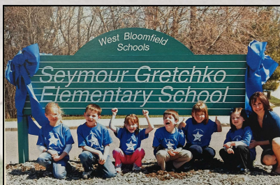
Gretchko earns Blue Ribbon Award, 2007

Teaching, learning, family, community, and traditions define the Gretchko environment. Spooktacular, Winterfest, Sweetheart Dance, Pine Cone Reading program, and the all-school musical production are annual highlights. Educational innovations such as Mandarin Chinese, project-based learning, and STEM concepts are integrated into the Gretchko routine.