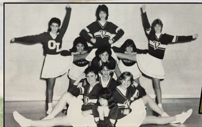
8th Grade Basketball Cheerleaders, 1985