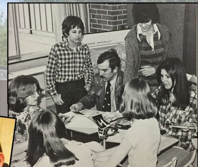
Yearbook staff, 1976

Sports have played an important part in the OLMS culture from the beginning. Intramural and interscholastic competition includes boys basketball, cheerleading, cross-country, flag football, football, girls basketball, roller hockey, swimming, track, volleyball, and wrestling.