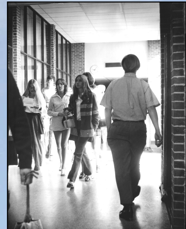
West Bloomfield High School, 1970