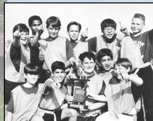
6th Grade Flag Football Champs, 1992

In 1974, concerns about inequities in course offerings between Abbott Middle School and Orchard Lake Middle School led the West Bloomfield School Board to redistrict, moving 200 OLMS students to Abbott. Families upset about the "busing" of their students, urged the recall of several School Board members. Despite the protest, the Board moved ahead with the plan. Ultimately, enrollment at the schools was better balanced and course offerings were made more equitable.