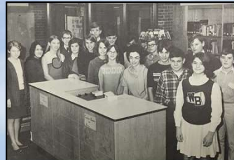
West Bloomfield Junior High library aides, 1966