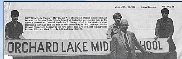
School renamed, 1972