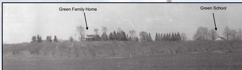
The one-room school was located near the intersection of Green Road and Savoie Trail.

The third Green School, built in 1948, included two large classrooms and two smaller rooms, used for industrial and domestic arts. This building has been renovated, expanded, and repurposed several times. It has housed the District Media Center and local cable commission. Once nicknamed "Little Green", the building was formally named Green Media Center in 2011.