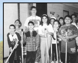
Ealy gym class, 1992