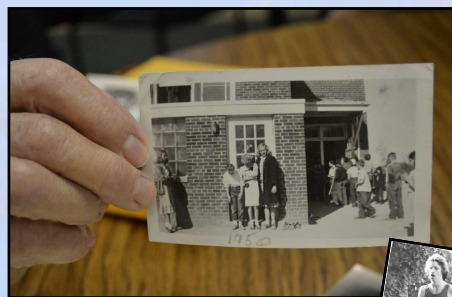
Community members shared photographs and memories, here Scotch School, 1950