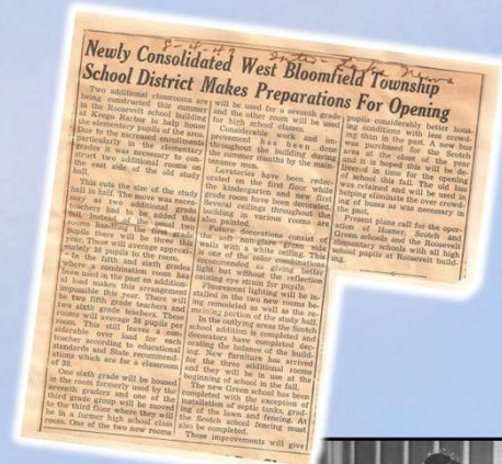
School district consolidation, 1949