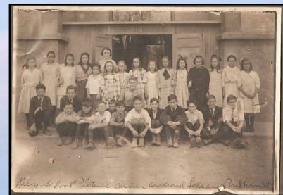
Keego Harbor School, 1920