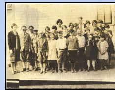
Green School students, 1925