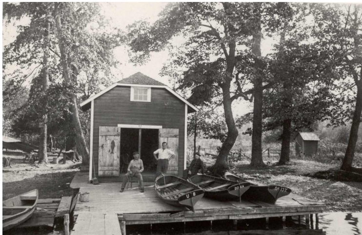
Boat Livery on Orchard Lake

The City of Orchard Lake Village is centered around Orchard Lake. This beautiful lake has always been valued for its recreational opportunities.