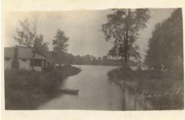
This is the canal that connects Dollar Lake with Cass Lake on September 10, 1923.

The “harbor” of Keego Harbor is actually Dollar Lake. Real estate developer Joseph E. Sawyer connected the small lake to Cass Lake with a canal in the early 1900's.