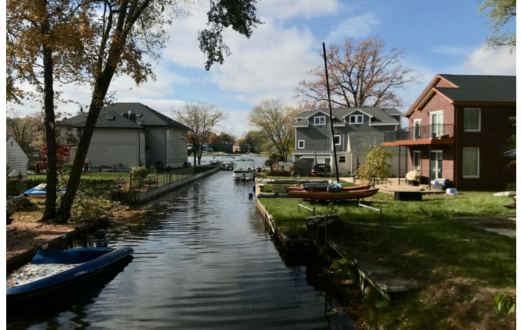
This is the canal as it appears today.