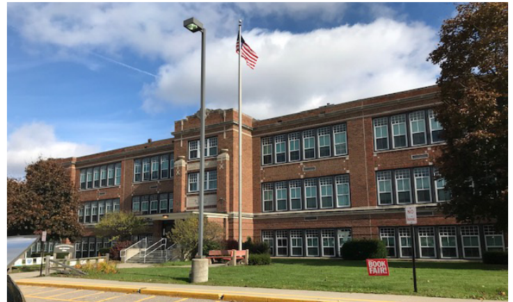
2019, Roosevelt Elementary Today Roosevelt is a K-5 school in the West Bloomfield School District.