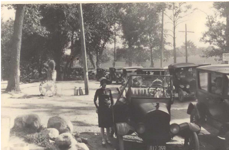
Circa 1920s, Wilkin's Corner Traffic at the corner of Orchard Lake Road and Pontiac Trail was heavy even in the early days of automobiles. Here an unknown woman waits outside of Fred Wilkin's gas station.

Voters decided to incorporate as a village separate from West Bloomfield Township in 1928. They voted to become City of Orchard Lake Village in 1964.