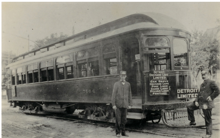
The Detroit Interurban provided a way for Detroiters to explore the Greater West Bloomfield area at the beginning of the 20th century..

OAKLAND 200 TM COUNTY MICHIGAN — BICENTENNIAL — 1820-2020