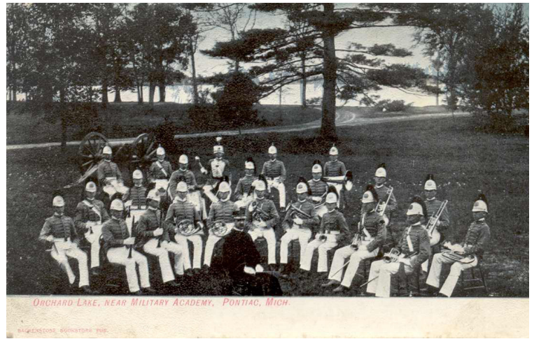
Circa 1900, Michigan Military Academy From 1878 to 1908, the Michigan Military Academy was the "West Point of the west" on the shores of Orchard Lake. Today it's campus is the location of Orchard Lake Schools. Here the Academy band poses near the lake.