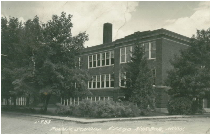
Circa 1950s, Roosevelt School Roosevelt was once a K-12 school.

Keego Harbor's only school is beloved by the community.- Roosevelt Elementary celebrates 100 years in 2020.