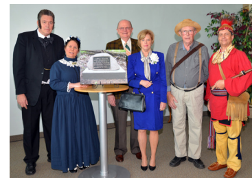
Left photo: Apple Island Celebration Committee; Middle photo: Elected civic leaders; Right photo: historic skit cast members

A certificate of recognition from West Bloomfield Township was received at the July 8, 2019 board meeting.