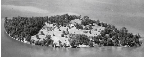
Apple Island, c. 1928

And out far away o'er the water's bright sheen A place of enchantment is there; A beautiful isle like an emerald green In its setting of silvery fret-work is seen A spot so alluring and fair.