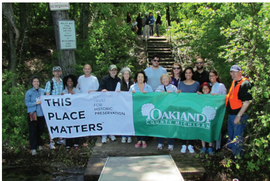
Apple Island visitors display the This Place Matters banner in May 2016.