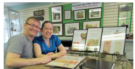
Couple at the Valentine's Day Open House