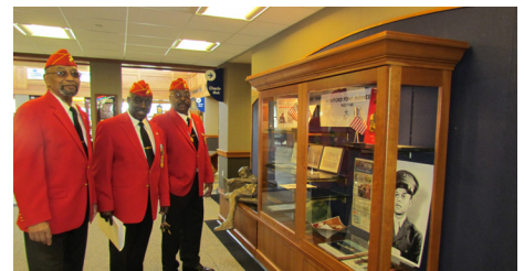
Members of the Montford Point Detachment at the February library event