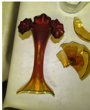
Vase found on Apple Island, 2013