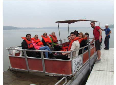
Tour goers take a pontoon boat ride to Apple Island for the 2.5 hour trip.

We are seeking sponsors for this event. Sponsorships start as low as $25 for an Apple Sponsor, which includes having your name listed on the event's web page and in the newsletter. More details about sponsorships are available at gwbhs.org/sponsorships .