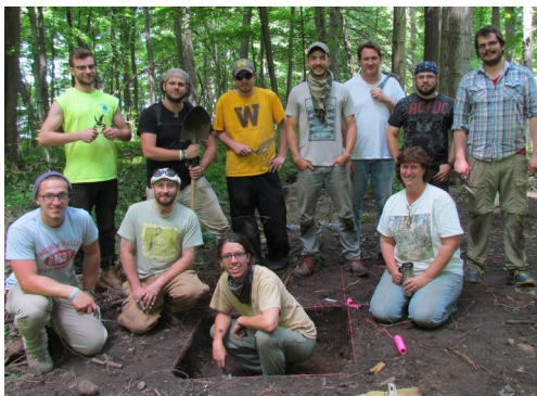
Members of the WMU dig team on Apple Island, 2014