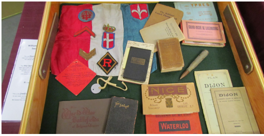
World War II mementos at a recent Open House