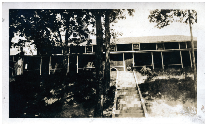
Oak Hill Beach Club building viewed from the dock, circa 1930s.