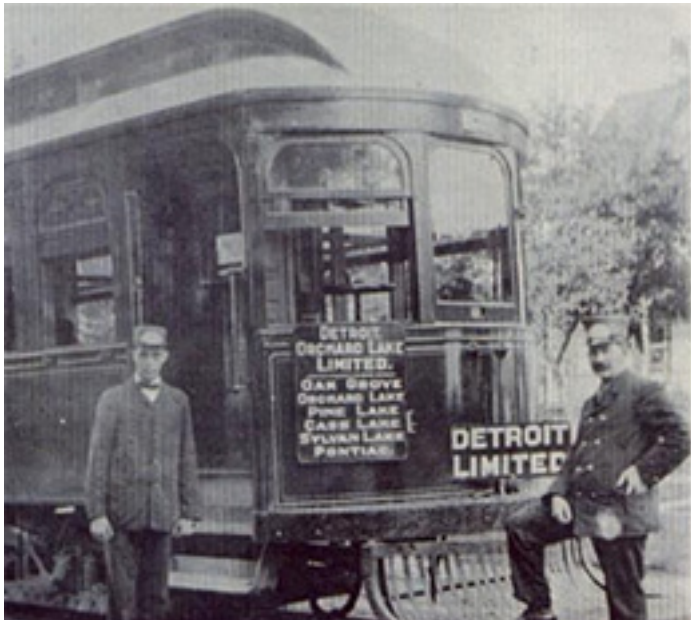
Interurban car #7164 showing stops at Oak Grove, Orchard Lake, Pine Lake, Cass Lake, Sylvan Lake and Pontiac.

Greater West Bloomfield Historical Society Keego Harbor • Orchard Lake • Sylvan Lake • West Bloomfield