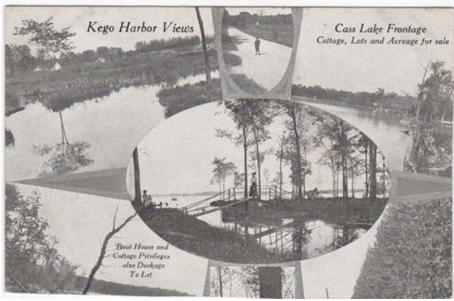
Top Photo: Summer residents and weekenders enjoyed the area's lakes 1903.

Bottom Photo: Real Estate developers began to market lake property to people seeking full time residency.