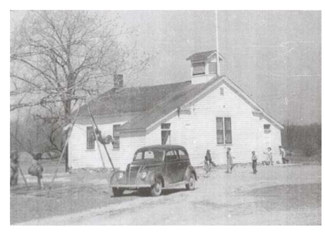
Green School 1940 c.

Green School was a wood frame structure, painted white. On the front of the building were two entryways, one for the boys and one for the girls, though there was no hard and fast rule about which you could enter. This is where all of the children's coats and galoshes were held. On top of the school there was a bell purchased from Geneva, New York. It was one of three bells the school had. One of those bells was destroyed when someone turned it upside down and filled it with water. The water froze and cracked the bell. How it ever came to be on the ground is a mystery.