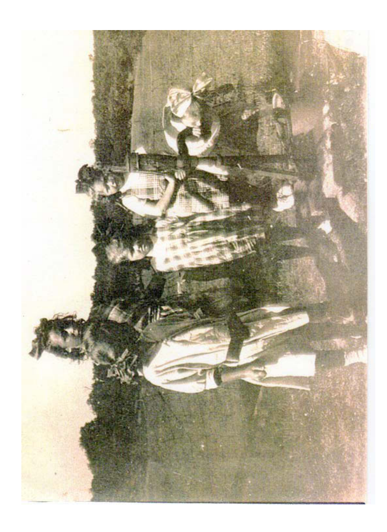
The Young girls at the second Green School.