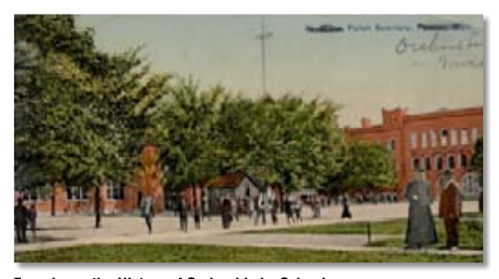
Experience the History of Orchard Lake Schools

I hope you will show your support by joining us at our events throughout 2014. Be sure to bring your friends and family!