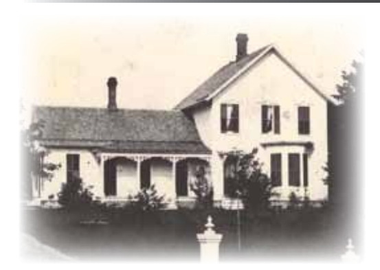
Emmendorf House pre-1900