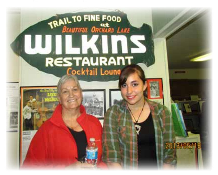
Wilkins relatives visit the Orchard Lake Museum exhibit about their family during the Apple Island Tours.