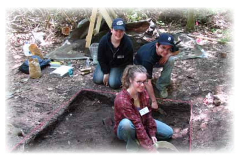
Students from Western Michigan University excavate a pit at the site of the Devendorf House on Apple Island.