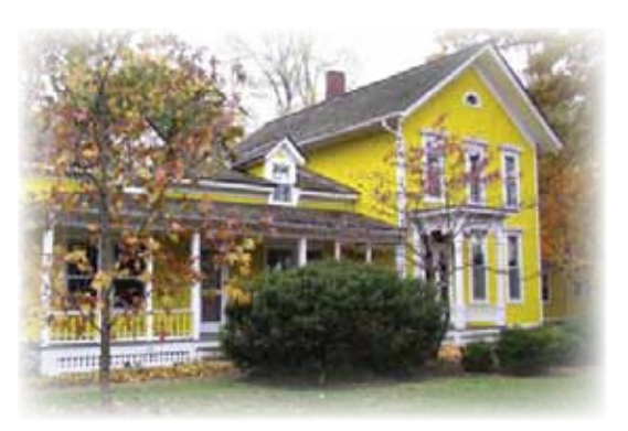
Emmendorf House circa 2011

Save the date! For the first time in 28 years, GWBHS will host a Historic Homes Tour! Living with History: Historic Homes Tour of Greater West Bloomfield will take place Saturday, June 21, 2014, from 10 am – 4 pm. Watch for more details to come about this self-guided tour of historic homes in greater West Bloomfield.