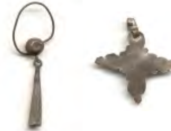
Artifacts found on Apple Island during the first archeological dig during the summer of 2000

Offered annually the 3 rd Weekend in May