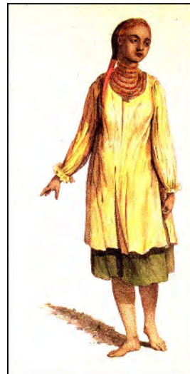
Unidentified woman, circa 1770