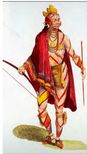
Ottawa man, circa 1725

Unfortunately, only archaeological evidence exists for Native American cultures before the arrival of Europeans, as these groups did not record information in written or graphic form. Post-European contact, however, there were many images of Native Americans created by whites—although by this time, Indian ways of life had been altered dramatically and bore only some resemblance to life pre-contact. Note that the Ottawa man below sports metallic jewelry and the woman wears a cloth dress, both evidence of the presence and influence of white settlers.