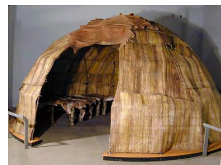
Recreation of a Huron wigwam

Although each nation had its own language, customs, and ways of life, there were some commonalities among them. Most of the groups that arrived circa 400 A.D. were hunter/gatherers and farmers. Men caught fish, rabbits, deer, moose, bear, and other game. Women cultivated crops like squash, beans, and corn. Local Native Americans lived in houses made of the materials right around them: bark, branches, hides, and mud. They made clothing and shoes from animal skins. And they made tools (such as those in the Orchard Lake Museum) from stone and animal bone.