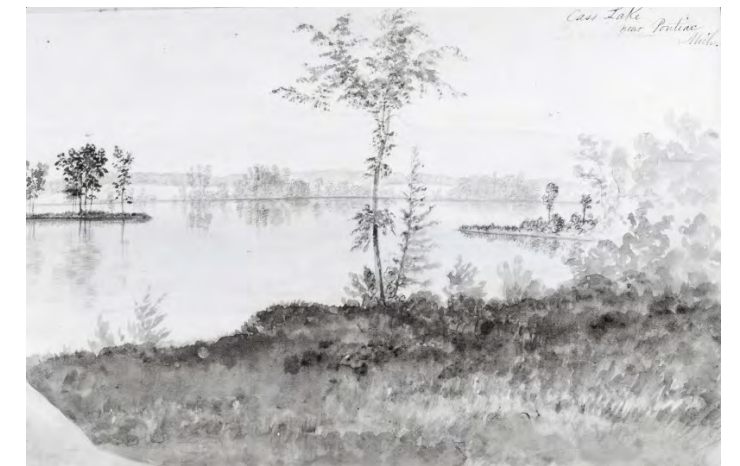
Edwin Whitefield's 1859 sketch of Cass Lake

The earliest surviving images of West Bloomfield Township were created by artist Edwin Whitefield in 1859, long after Native Americans had left and white farmers had begun pouring in. But Whitefield's sketch of Cass Lake, which illustrates the pristine naturalness of the land (although some agricultural clearing is visible in the background), gives some idea of what the township would have looked like before white settlement.