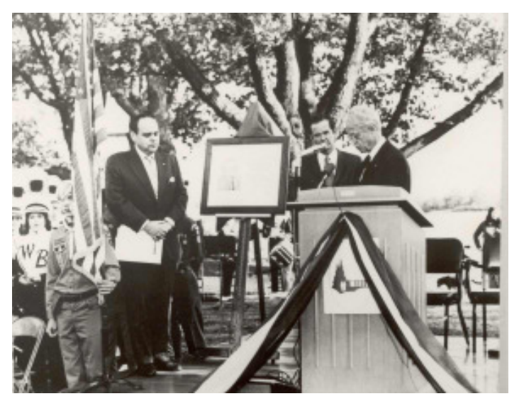
General Frederick S. Strong and Michigan Governor William Millikin during the ceremony presenting Apple Island to the West Bloomfield School District (1970).

The Sanctuary (and its characteristic resources of soil groups, shore edges, oak forest stands, bogs and topography) is unique in that it contains examples of every type of ecological system identified within the southeastern Michigan region. It is home to more than 400 species of trees and plants, including many rare in Oakland County. A detailed account of the island's flora can be found in Apple Island: The Marjorie Ward Strong Woodland Sanctuary , which is available from the Greater West Bloomfield Historical Society.