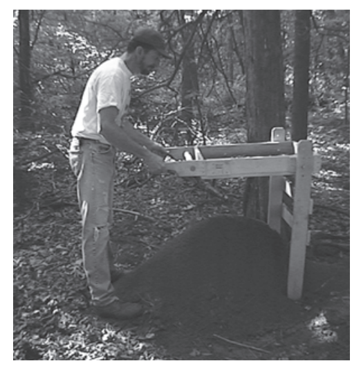
Summer of 2000 archeological dig

One sign of early European influence on this area's native population is the appearance of silver trade items, several of which were recovered during archaeological excavations on the island in June 2000. Jointly organized by the Greater