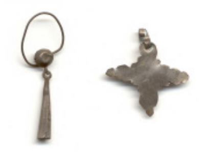
Artifacts found on Apple Island during the first archeological dig during the summer of 2000

Sponsors of the Apple Island Tours offered annually during the 3<sup>rd</sup> Weekend in May