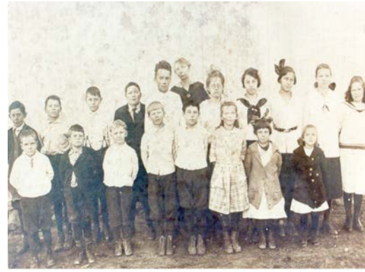
Eagle School students 1918