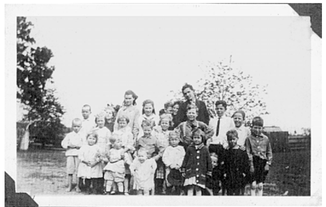
Pennell School Picnic, Halsted Road, May 1922