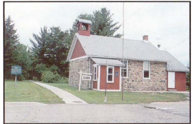
German Stone School 2013