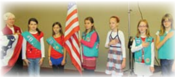
Girl Scout Troop 41320 opens Our Local Veterans with a flag ceremony on November 10, 2013. The girls also provided homemade cards to the veterans.